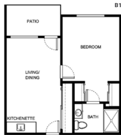
ONE BEDROOM 549 sq. ft