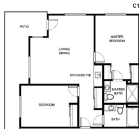
TWO BEDROOM 975 sq. ft